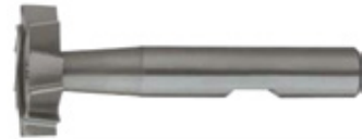
WWK ÇAPRAZ T. FREZE (DIN850)